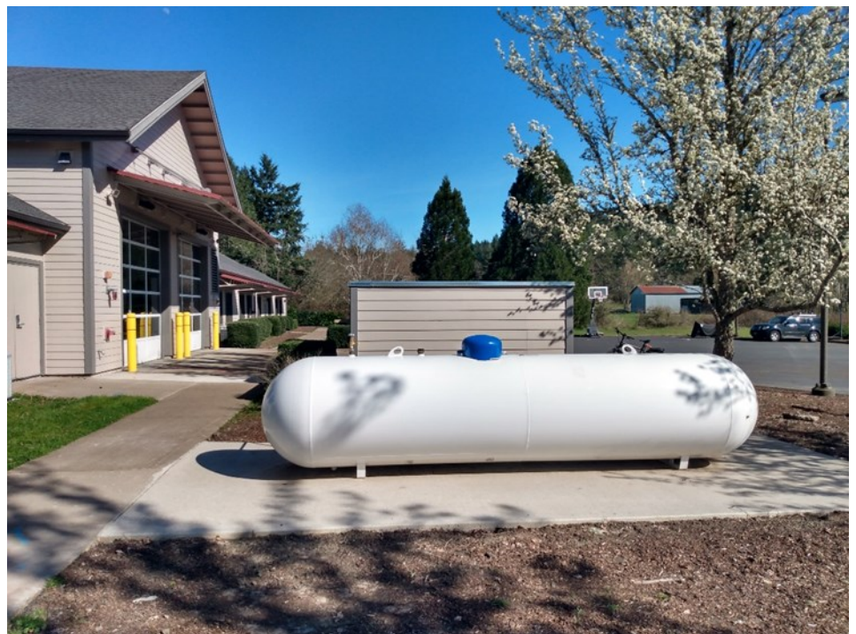
New 1,000 Gallon Propane Tank Adjacent to Generator Enclosure

This welcome addition to Locke Station will result in greater resilience in case of natural or man-made disasters that could otherwise severely hamper maintaining service to our District members from Locke Station. Other potential future enhancements to increase resilience for the station would be the addition of solar panels with battery storage capability.