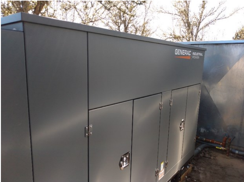
New Generac Dual-Fuel Generator

As part of the project, both the generator enclosure and slab underneath were enlarged to allow installation of the new generator. A slab was also poured for the new propane tank; all concrete work was done with earthquake survival in mind.